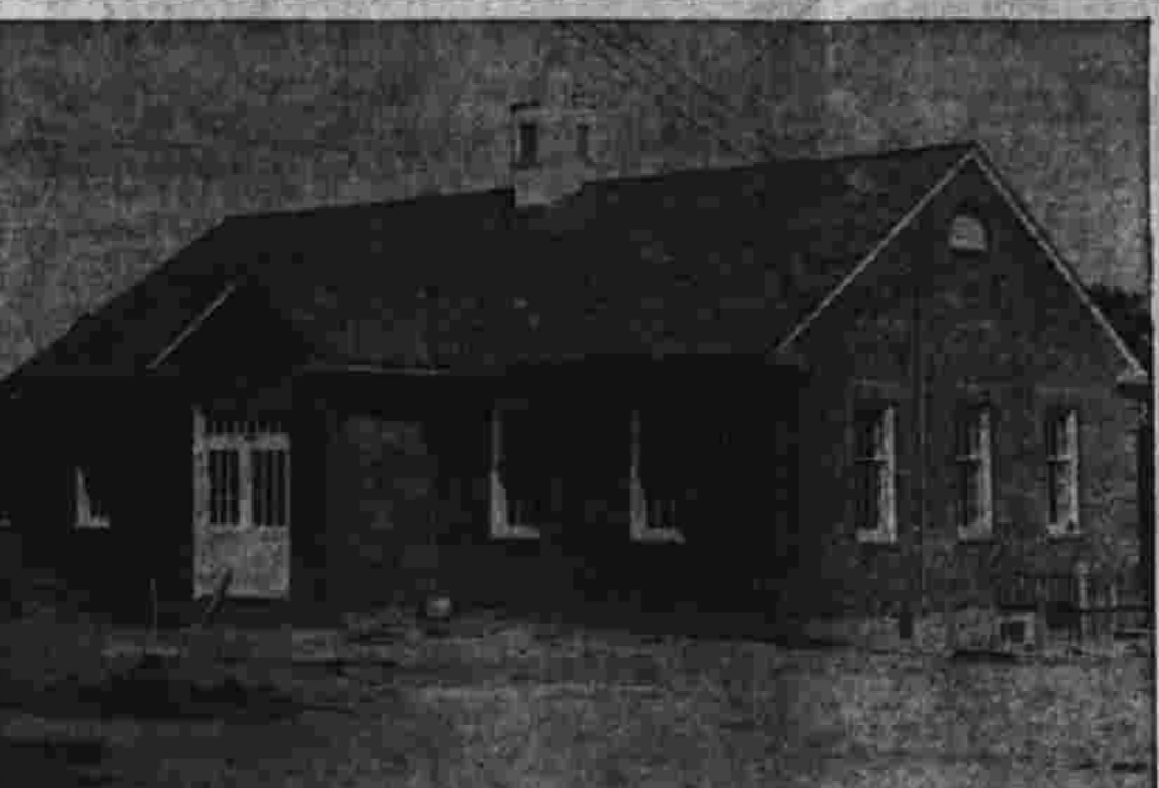
The Manchester Trust Company's new North Branch on the corner of North Main and Oakdale streets shows a completed exterior to passersby as work continues inside the building in preparation for the branch's opening sometime in September.